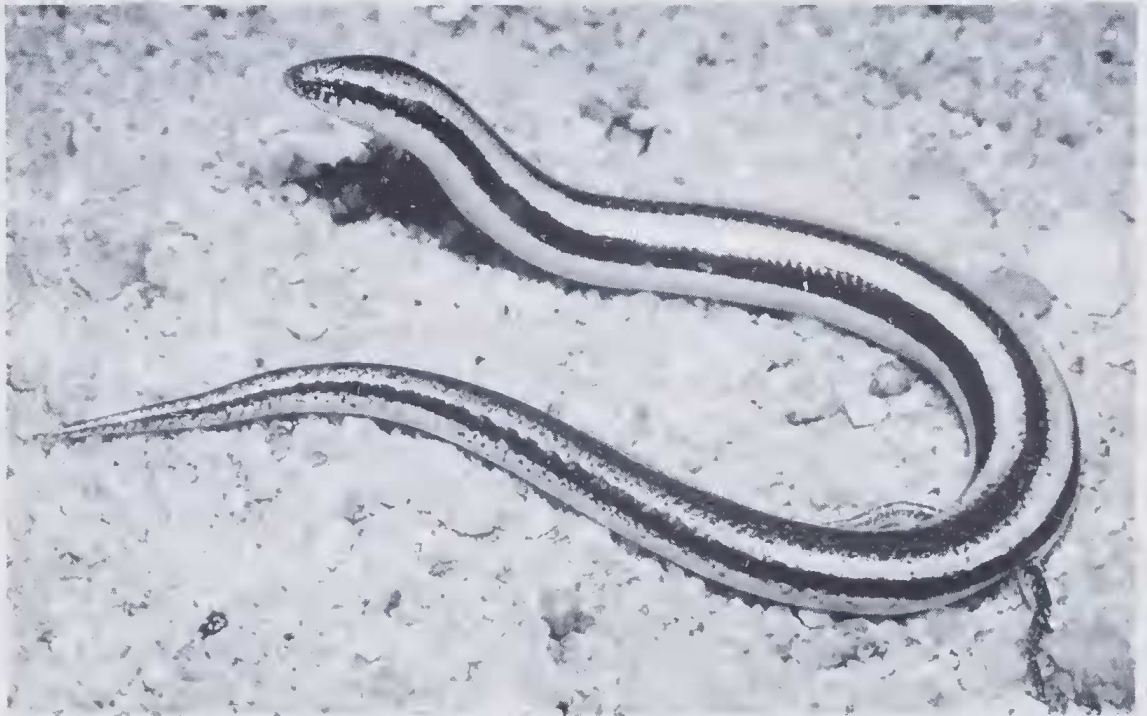
Figure 1 A paratype of Lerista gascoynensis , photographed by G. Harold.

Coloration in alcohol. Dorsally brownish white except for brown edges and blotches on head shields and for narrow vertebral stripe (consisting of two rows